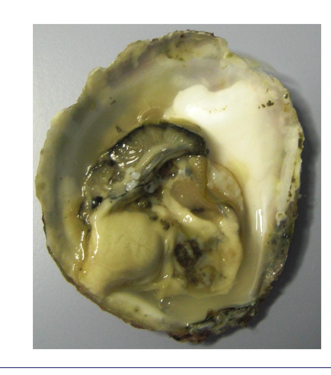
Figure 3 (left): Flat oyster sample.

Several public institutions and private enterprises are providing water, microalgae and shellfish samples from a great variety of ecosystems, which are being tested with the developed assays and biosensors. Their performance and validity will be checked by comparison with LC-MS/MS analysis. Matrix effects have also been evaluated (figure 4).